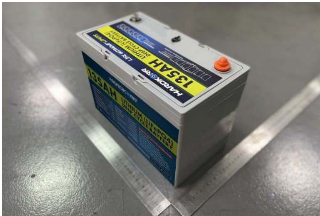
Figure 2 Back view of battery