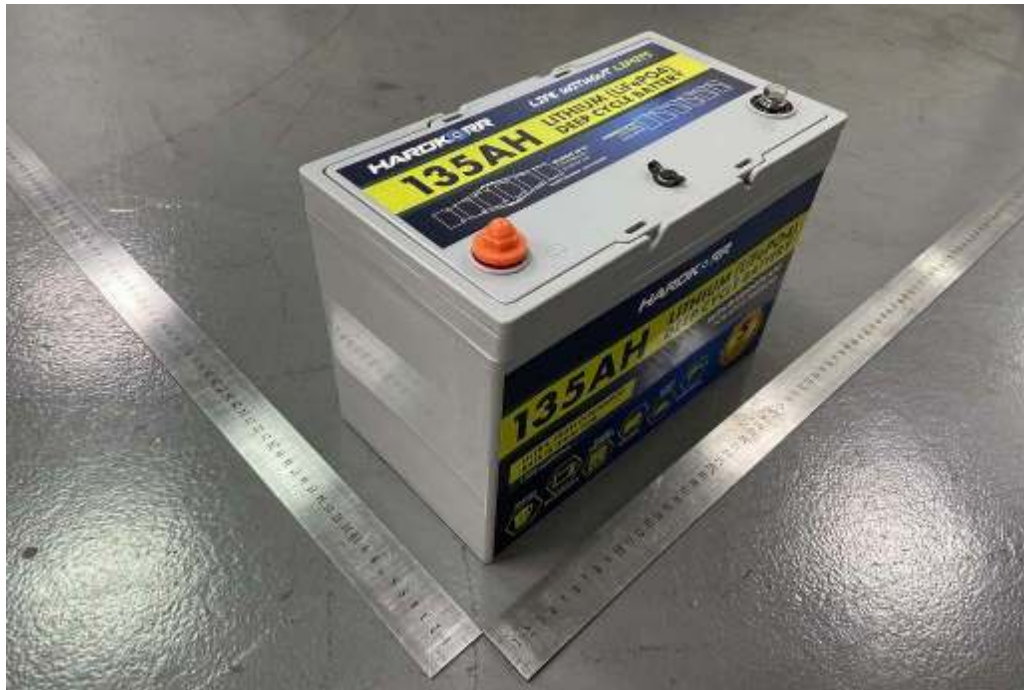
Figure 1 Front view of battery

磷酸铁锂电池 / LiFePO4 Battery (12.8V, 135Ah, 1728Wh)