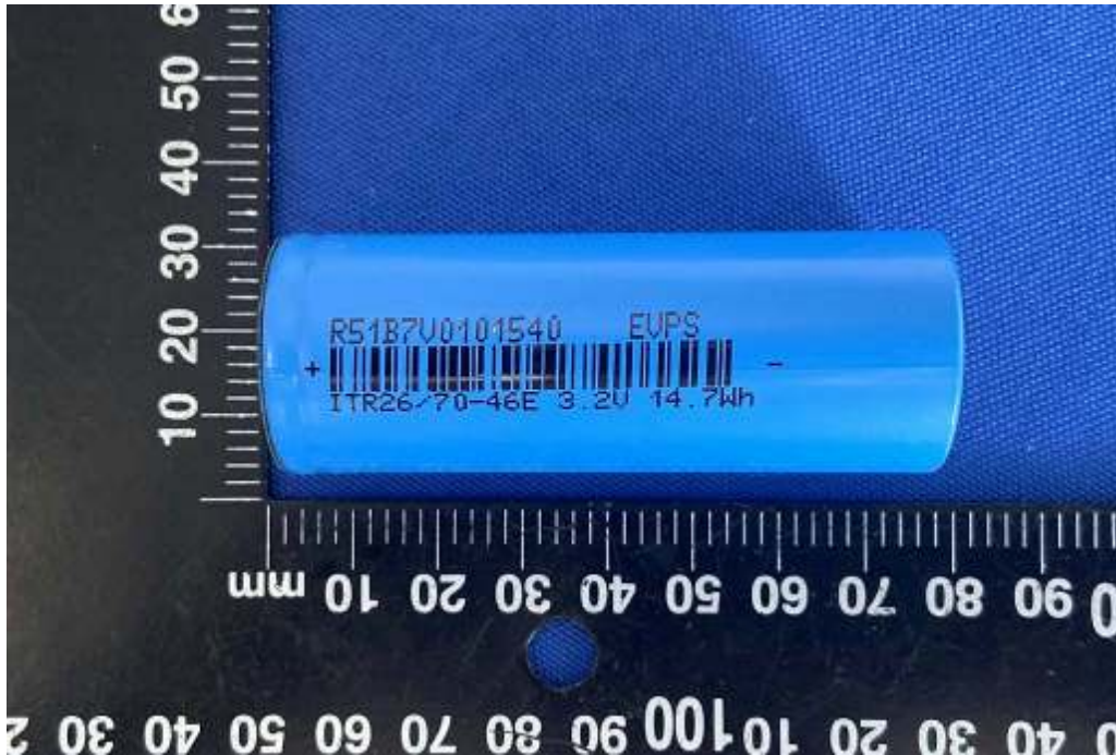
Figure 3 Side view of cell