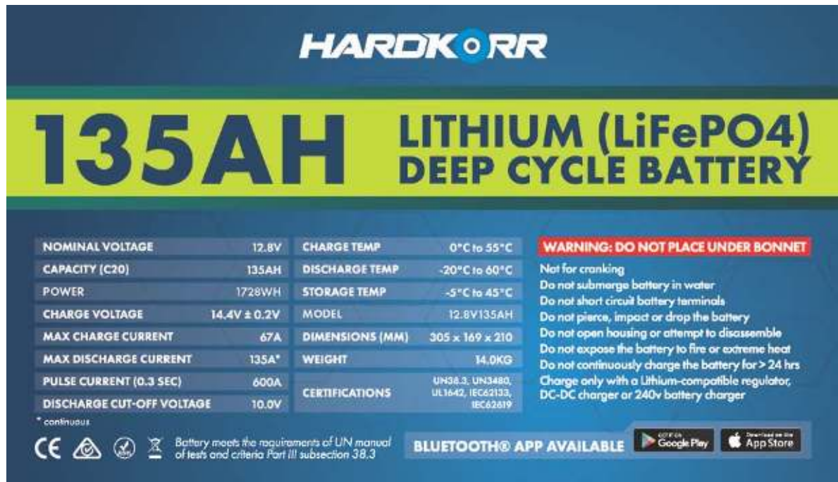
Figure 5 Battery label