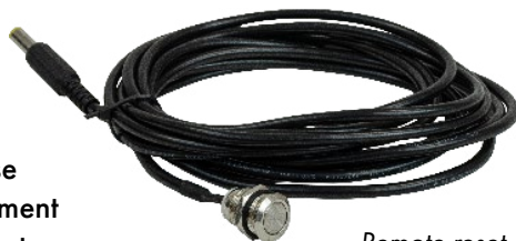
Remote reset switch & cable

By continuously tripping the low-voltage disconnect you may cause damage to sensitive electronic equipment that is attached to the battery such as stereo equipment. This is not covered under the battery warranty.